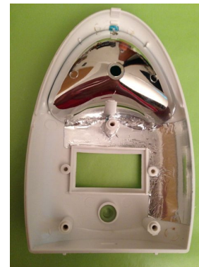
Figure 8: Add Foil