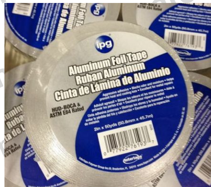
Figure 2: Aluminum Foil Tape

Step 2: Disassembly: Remove the battery cover and 3 screws to separate case. Next remove the screw holding the LED to free the circuit board. (Figures 3 and 4)