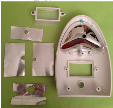
Figure 7: Remove the Passive IR Sensor (PIR) lens

Step 4: Shield front case. Remove the Passive IR Sensor (PIR) lens (Figure 7), and pre-cut several strip of foil tape with holes and/or slots for the obstructions. Once all 4 main foil segments are installed, use the leftover foil scraps the fill in missing areas and trim and smooth the foil tape (Figure 8). Do not cover up the switch hole on the bottom of the unit.