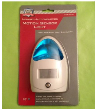
Figure 1: Motion Detector

Step 1. Gather items needed: Motion Detector (Figure 1) , Aluminum Foil Tape (Figure 2), Utility knife, Scissors, Small Phillips screwdriver, and a rounded object (pen cap?) for smoothing foil.