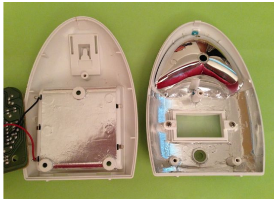
Figure 9: Reassembly

Step 5: Reassembly. The hard part is over now. Reinstall the PIR lens, the LED in the back case, and position the circuit board into the front case making sure the small protruding light sensor seats into it's round window and the switch thru it's hole in the bottom (Figure 9). Now, align the top tab and snap together front/back cases and the 3 screws and battery cover. You're done!!