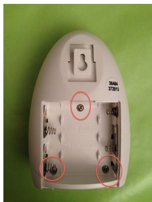
Figure 3: Remove Screws

Step 2: Disassembly: Remove the battery cover and 3 screws to separate case. Next remove the screw holding the LED to free the circuit board. (Figures 3 and 4)