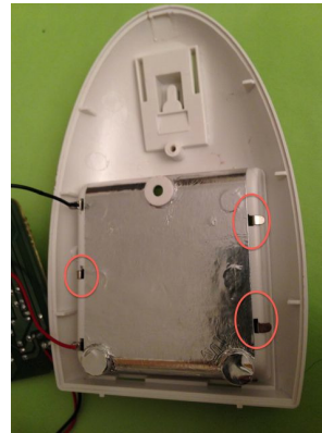
Figure 6: Use Foil to Cover Battery Case

Step 4: Shield front case. Remove the Passive IR Sensor (PIR) lens (Figure 7), and pre-cut several strip of foil tape with holes and/or slots for the obstructions. Once all 4 main foil segments are installed, use the leftover foil scraps the fill in missing areas and trim and smooth the foil tape (Figure 8). Do not cover up the switch hole on the bottom of the unit.